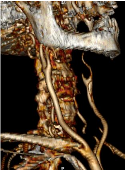
Figure 1: computed tomography angiography of cervical vessels shows thrombosis within the right common carotid artery extending to the internal carotid artery