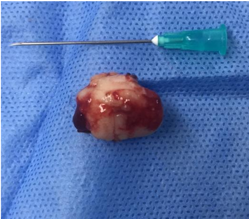
Figure 3: inferior aspect of the specimen