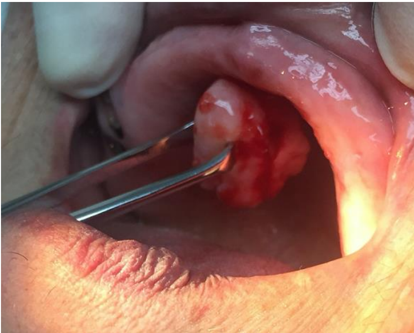
Figure 1: intraoral examination (before excision)