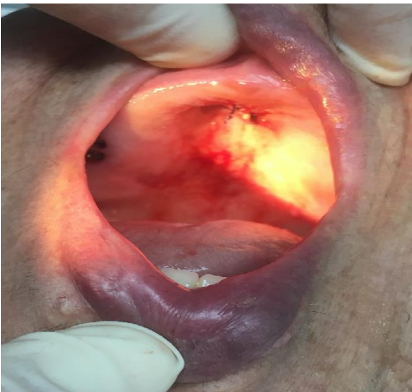
Figure 2: intraoral examination (after excision)