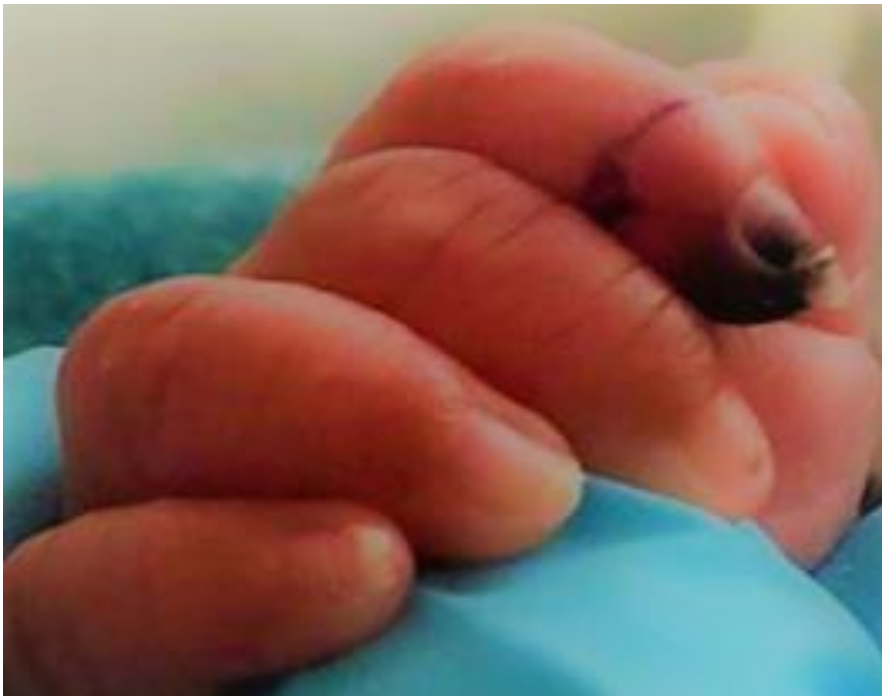
Figure 1: ischemia appeared on distal phalanx of right index finger; note the line of demarcation between the area with normal and abnormal perfusion