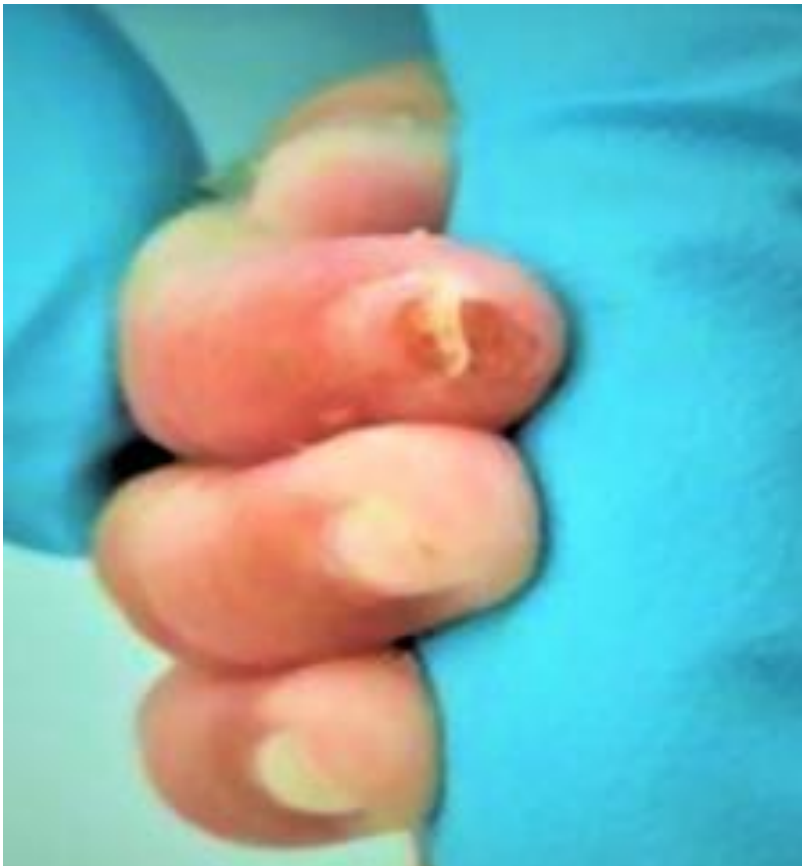
Figure 3: complete recovery of ischemic changes in distal phalanx after using; nitroglycerin patch; only superficial scab formation on fingertip is noted