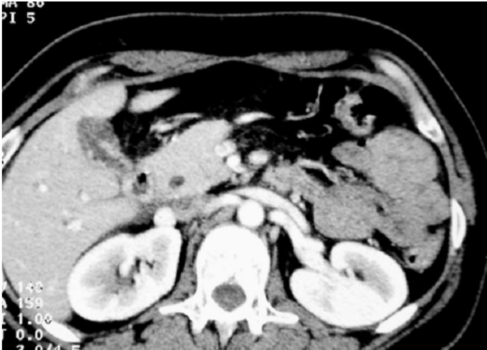
Figure 2: Gallbladder aspect in CT abdominal scan