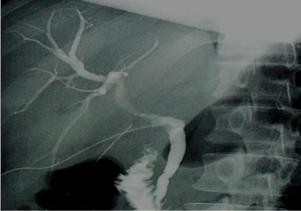
Figure 4: Preoperative cholangiographie