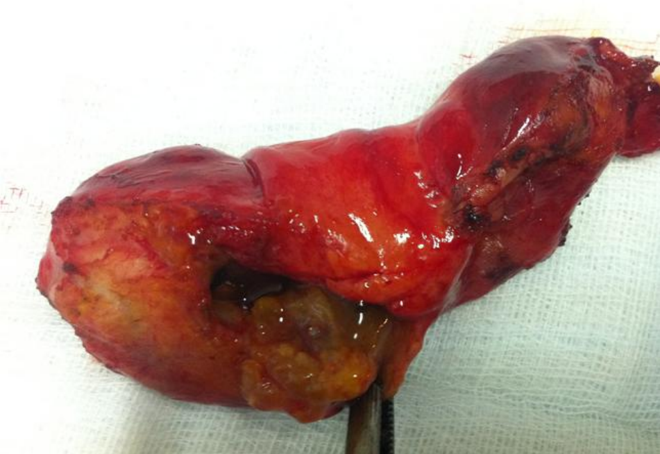
Figure 5: Macroscopic examination showing daughter cysts showing normal aspect of common bile duct in the lumen of the gallbladder