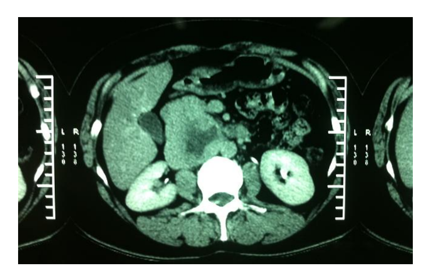
Figure 1: Axial CT scan image showing a round mass with a necrotic center, touching the aorta and inferior vena cava