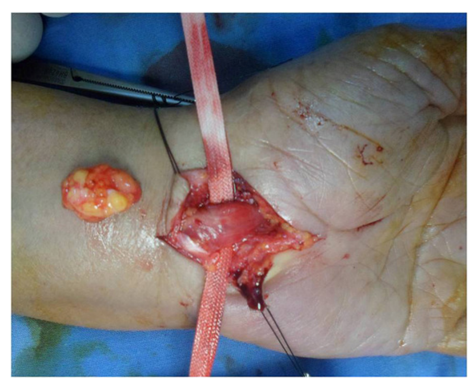
Figure 2: The tumor was carefully removed measuring 2.5 x 1.5 x 1 cm