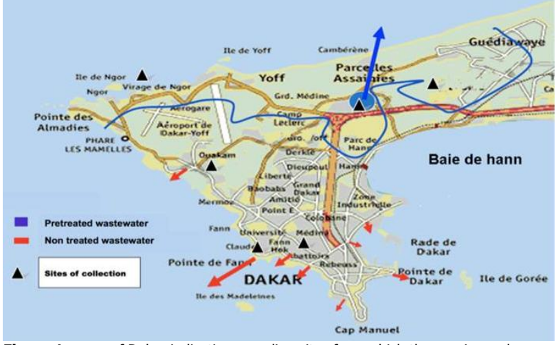
Figure 1 : map of Dakar indicating sampling sites from which the specimens have been collected for environmental surveillance for enteroviruses