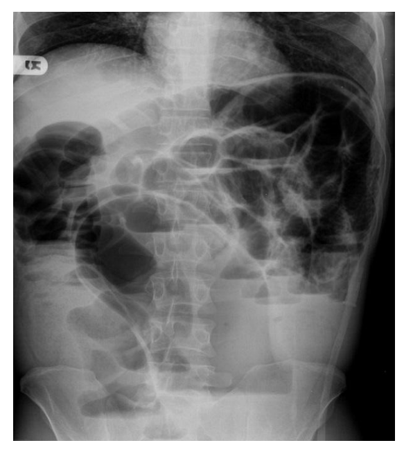
Figure 1: Plain upright abdominal X-ray showing dilated sigmoid colon and dilated small bowel with multiple air-fluid levels