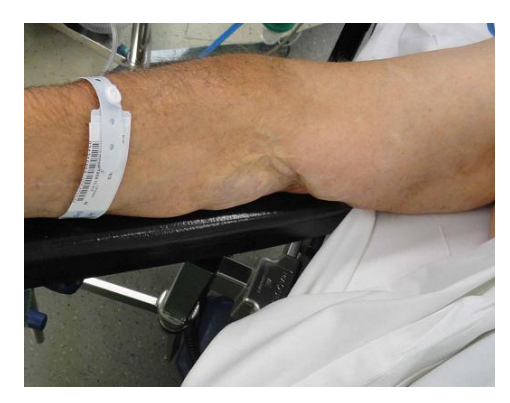
Figure 1 : Deformed and amyotrophic right upper limb due to radial nerve palsy complicating humeral communitive fracture