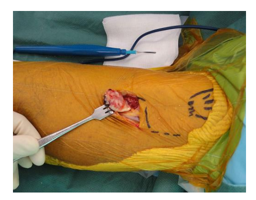
Figure 4: Single anterior approach of the elbow