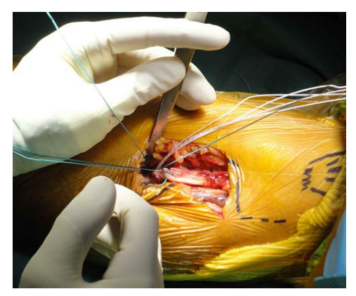
Figure 5 : Trans-osseous anchoring of the distal biceps tendon in bicipital tuberosity