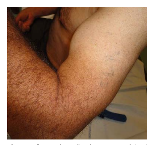
Figure 2 : "Popeye's sign" pathognomonic of distal biceps tendon rupture