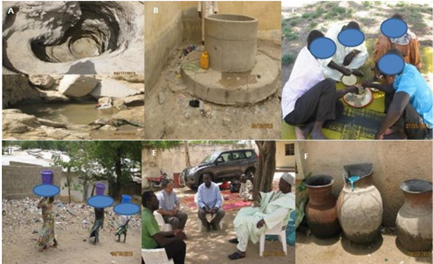
Figure 3: Some environmental conditions and cultural aspects that influence cholera exposure transmission: The community sources water from A potholes (top), ponds (bottom), and B open wells (everyone uses the yellow container in B to draw water), hallmarks of risky water sources. Group eating out of the same bowl using fingers C is a culture that can aid rapid cholera transmission and spread while water is transported D in open-mounthed containers, as explained by our Key Informant E (Key Informant—right, interviewers—left), and stored in open-mouthed jars F called 'caneri', placed at strategic locations from which all can dip water using a common cup (blue cup in the middle jar of F). Water driven travel (contact between folks from mountain and valley) in D could underlie rapid disease transmission. The Figure shows the environment, which together with culture, shape behavior that leads to cholera exposure.