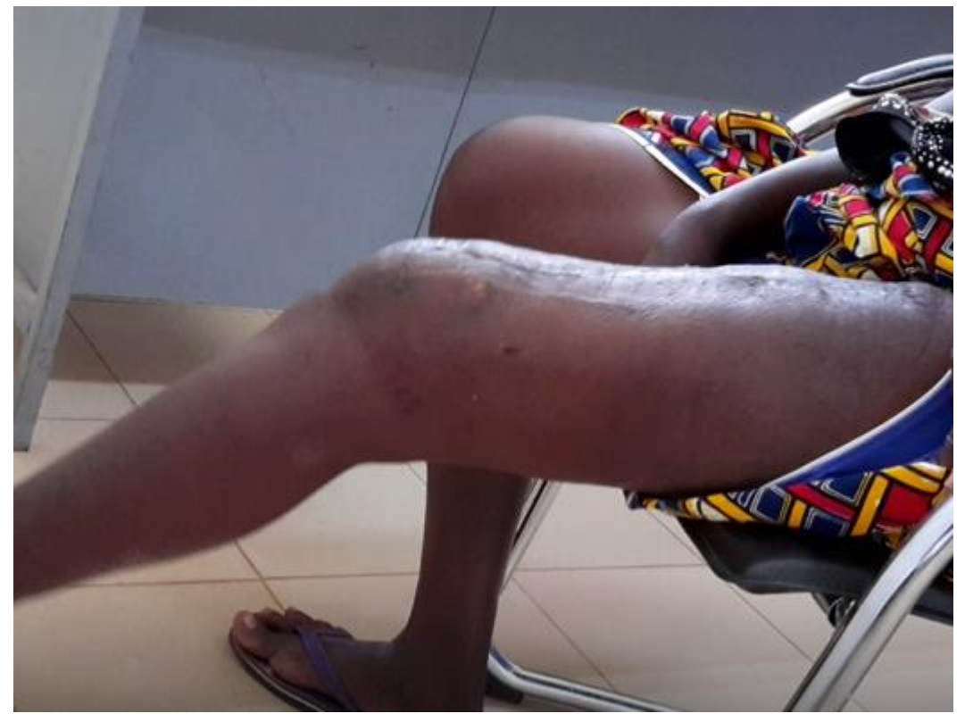
Figure 3: Patient at 3 months postoperative