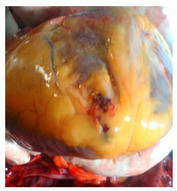
Figure 2 : Puncture wounds at the apex of the heart. Note the vital reaction at the site of the injury