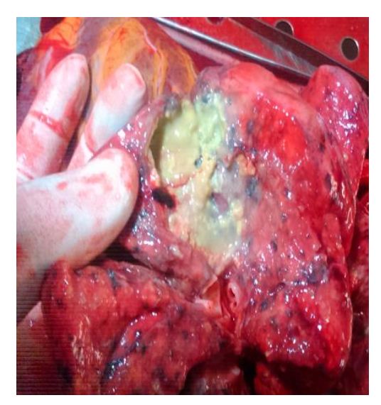
Figure 1 : Cut surface of the lower lobe of the left lung showing one of the areas of chronic granulomatous caseous necrosis