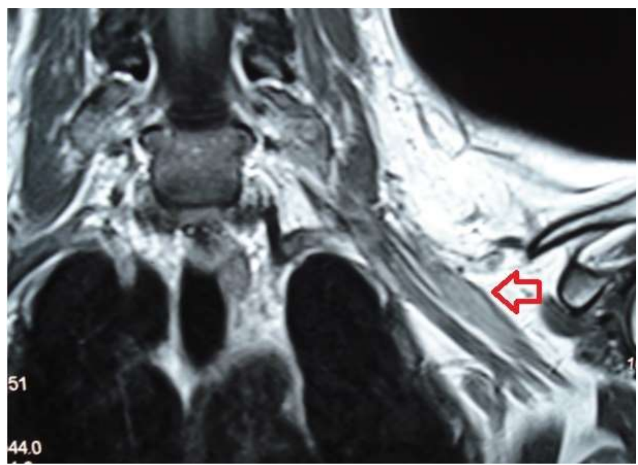
Figure 2 : MRI showing typical aspect of hyperintense T2-weighted images on the posterior trunk of the left brachial plexus