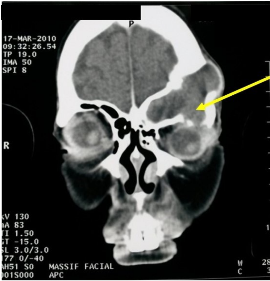
Figure 3: facial CT scan in frontal section: left frontal mucocele responsible for a lysis in the left roof of the orbit