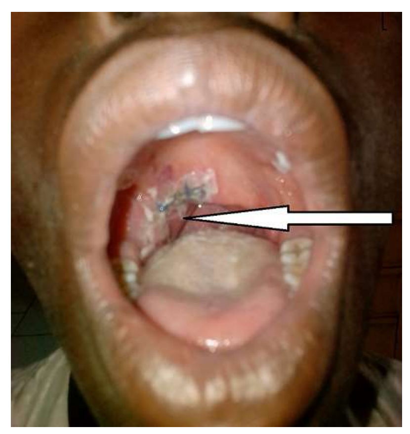
Figure 2: postoperative appearance after tumor reduction surgery