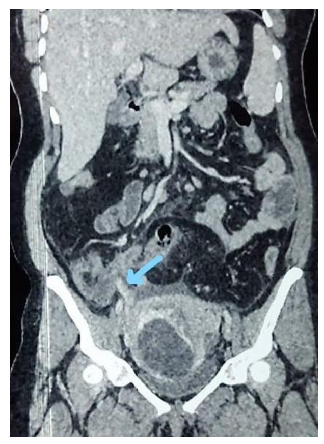
Figure 1 : Coronal reconstruction showing complicated acute appendicitis and pregnant uterus