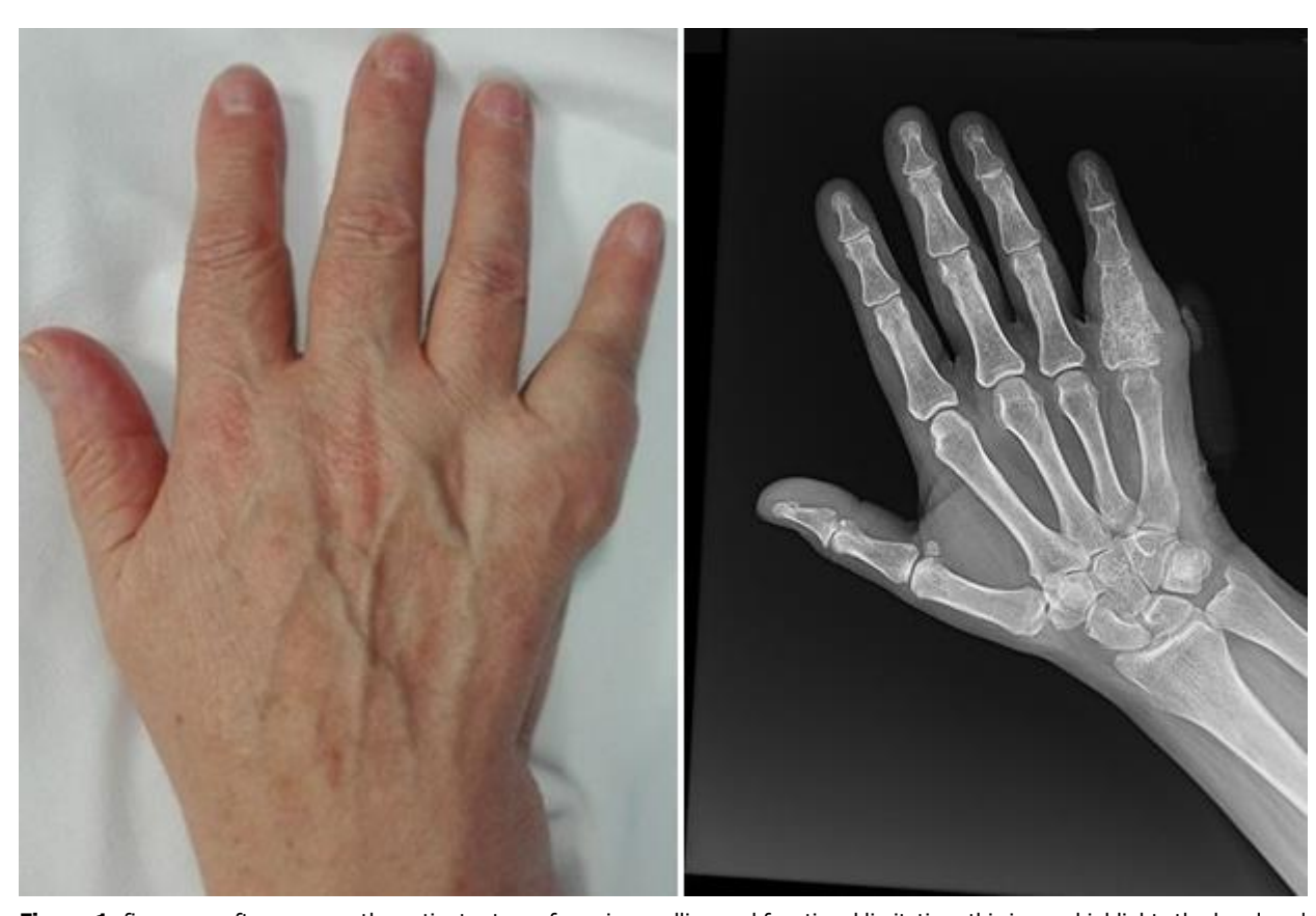
Figure 1 : five years after surgery, the patient returns for pain, swelling and functional limitation; this image highlights the hand and the X-ray with evident recurrence of the pathology