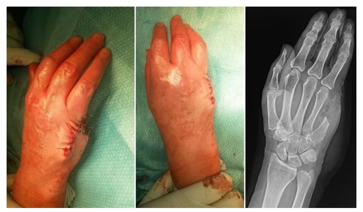
Figure 2: surgical and radiographic result immediately after surgery