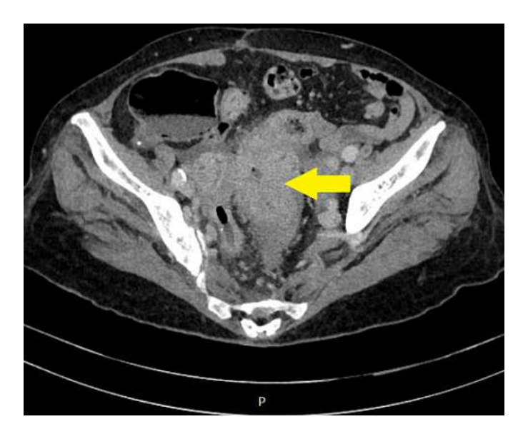
Figure 1 : abdominal computed tomography scan showing thickening of the sigmoid colon (indicated by arrow)