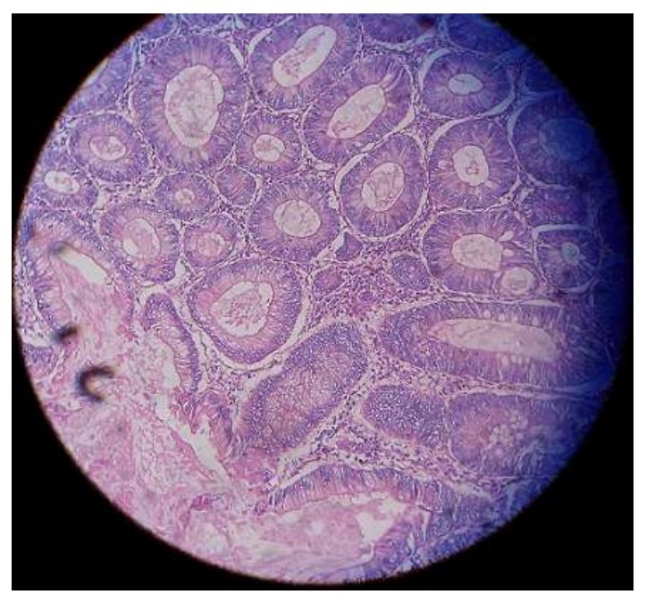
Figure 3 : a photomicrograph of sigmoid adenocarcinoma colored by the hematoxylin-eosin magnified at 40 times