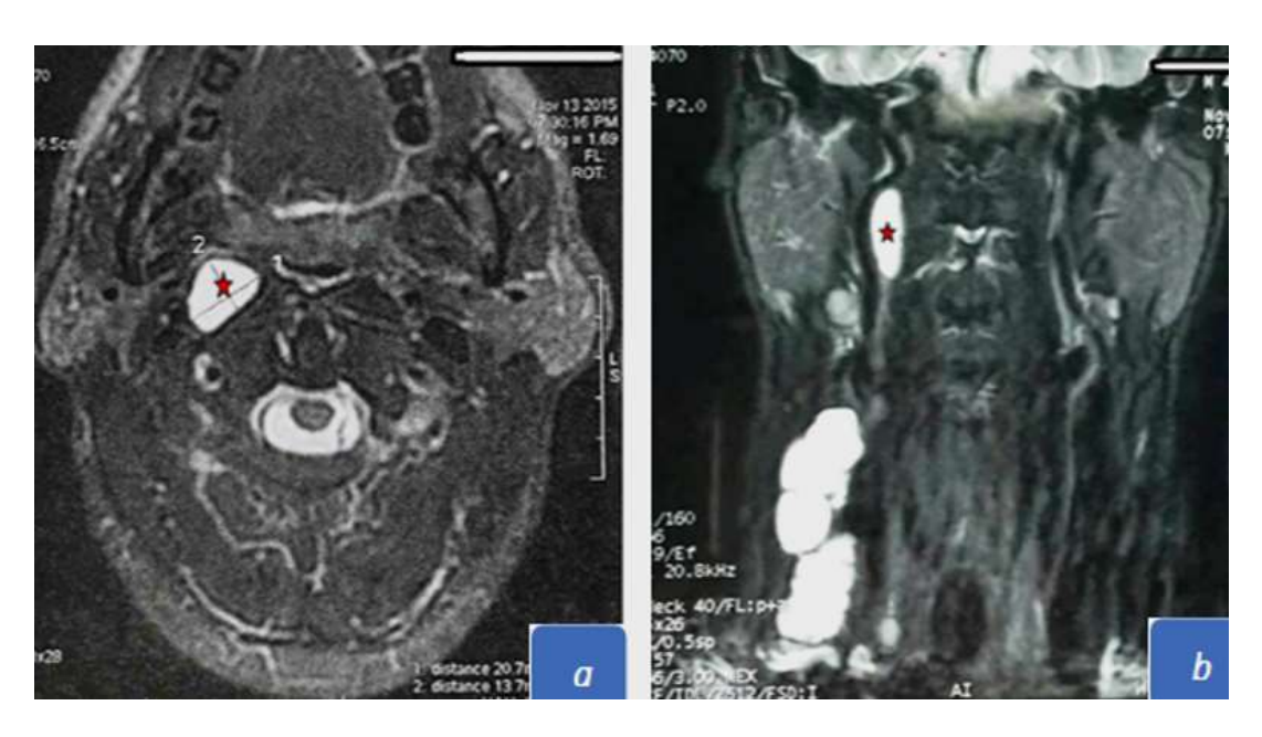
Figure 2: MRI showing enhanced lymph node swelling in the right retropharyngeal space which doesn't dislocate the internal carotid artery; a) axial T2 weighted with fat-suppressed; b) coronal T2 weighted with fat-suppressed