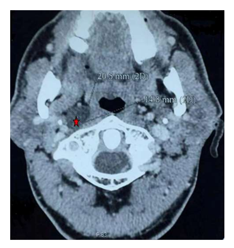
Figure 1: axial post-contrast CT image showing a non-enhanced cystic mass in the right retropharyngeal space