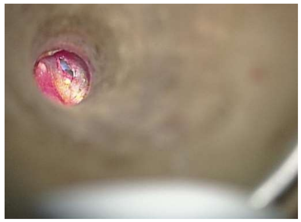
Figure 3 : per-operative view showing the presence of the tympanostomy tube in the middle ear cleft through a myringotomy incision