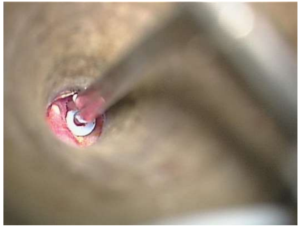
Figure 4: per-operative view showing extraction of the tympanostomy tube