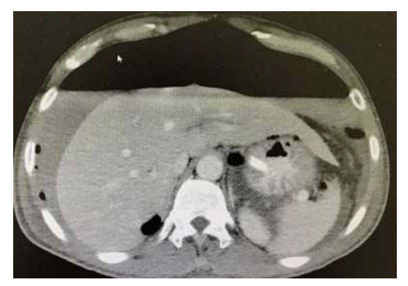
Figure 3 : CT Scan was 2 days after omental Graham patch operation, showing massive hydro pneumoperitoneum