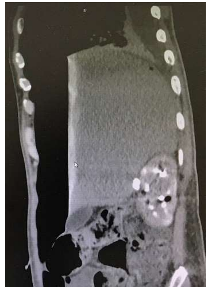
Figure 4 : CT Scan was 2 days after the first operation, omental Graham patch operation, showing massive hydro pneumoperitoneum