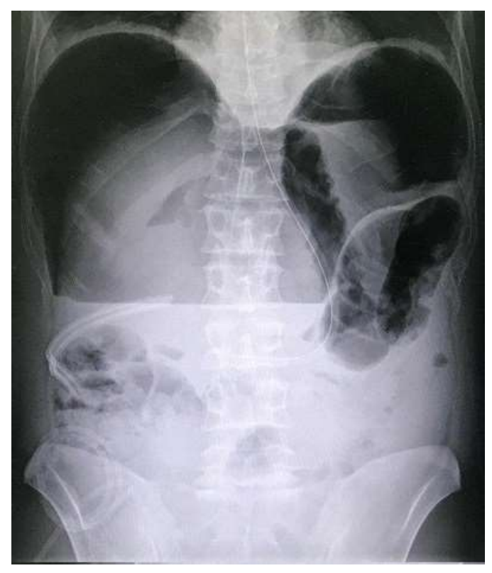
Figure 2 : second X-ray was 2 days after the first operation i.e. omental Graham patch operation, which showed a significant huge hydro pneumoperitoneum