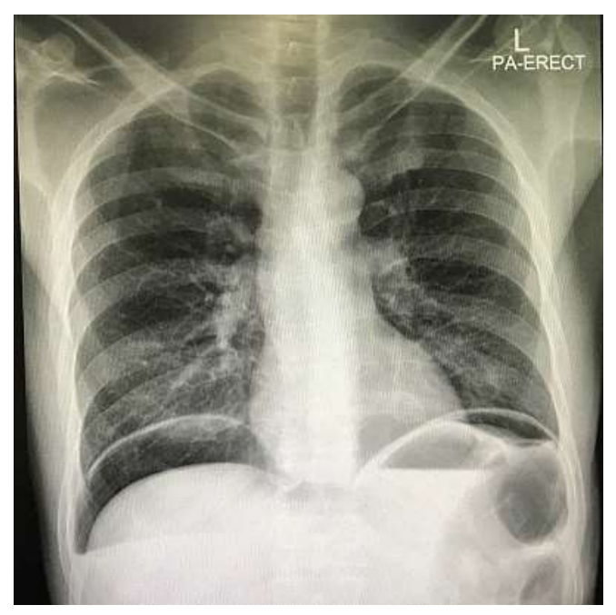
Figure 1: first X-ray was in ED which showed pneumoperitoneum with air fluid line