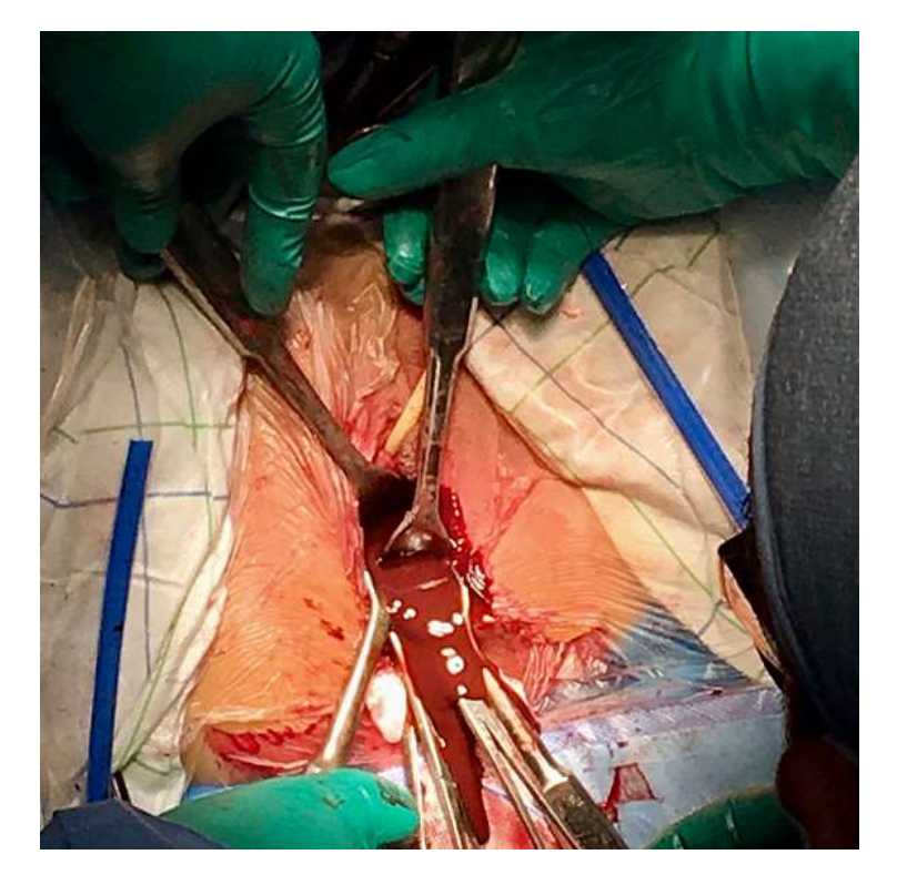
Figure 3: per-operative image of the drained hematometrocolpos