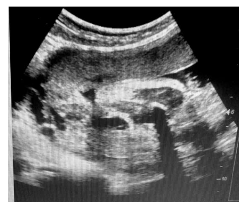
Figure 1: ultrasound appearance of the hematometrocolpos extending to the upper third of the vagina