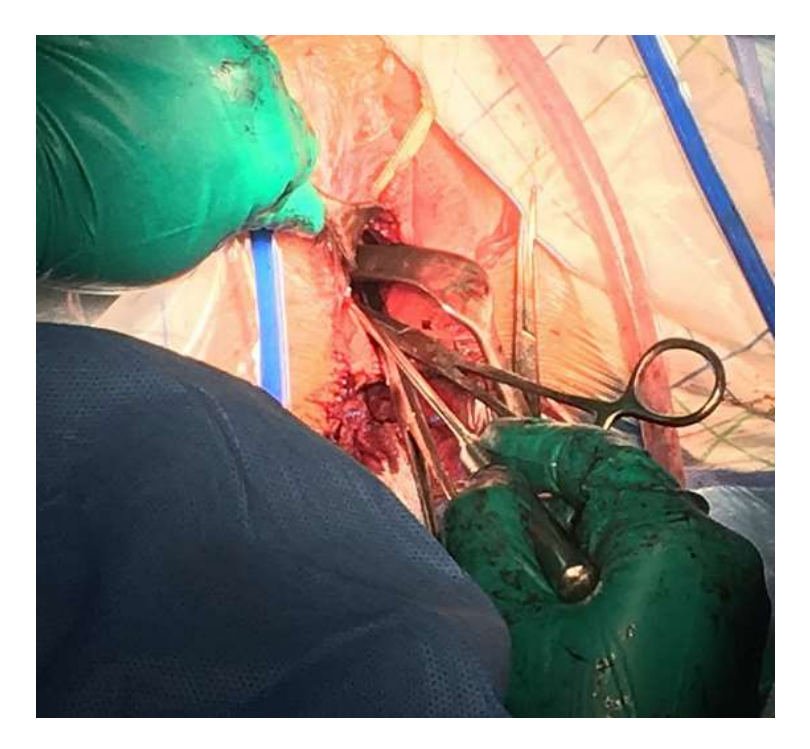
Figure 4: per-operative image of the hysterometer through the neovagina