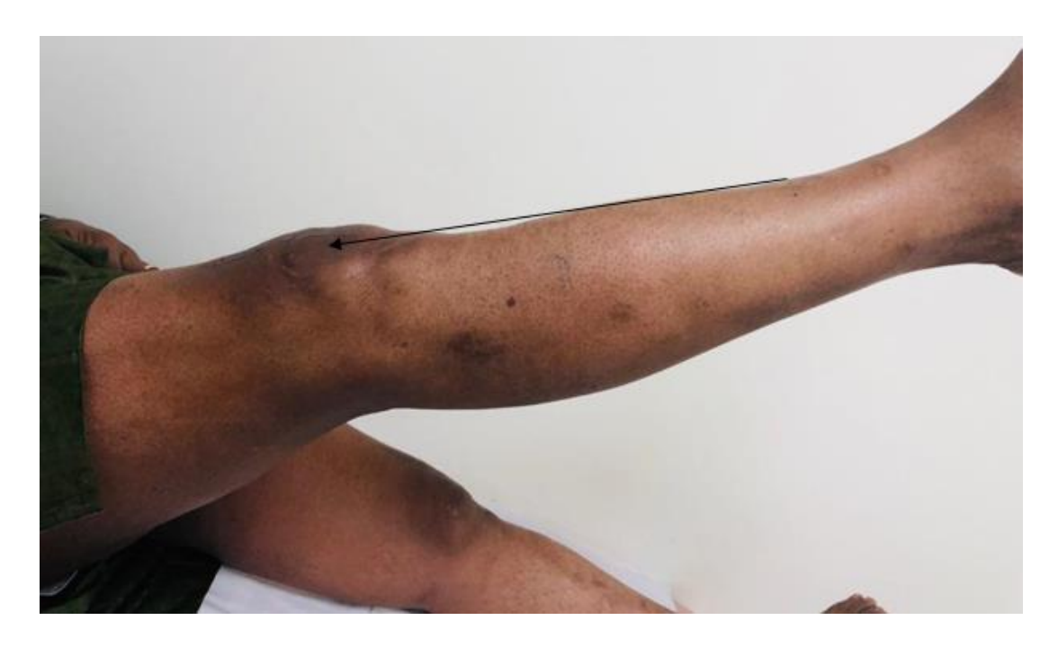
Figure 3: range of motion six (6) at months post-surgery