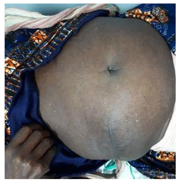
Figure 6: abdomen after 6-months post operation