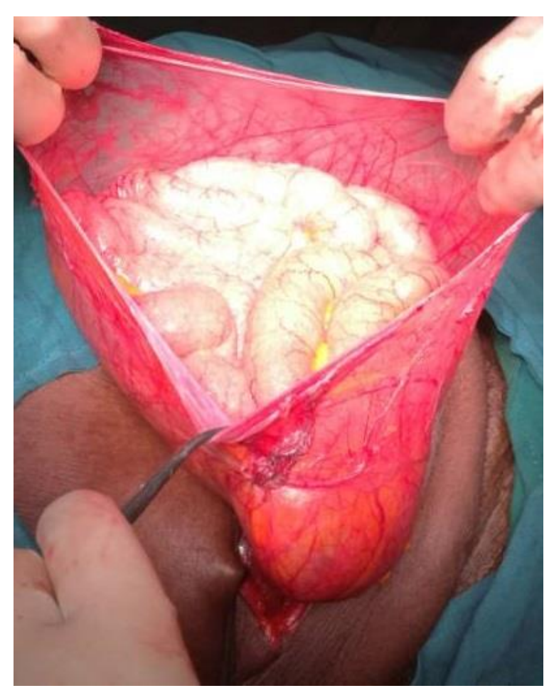
Figure 5: small bowels as content of the sac