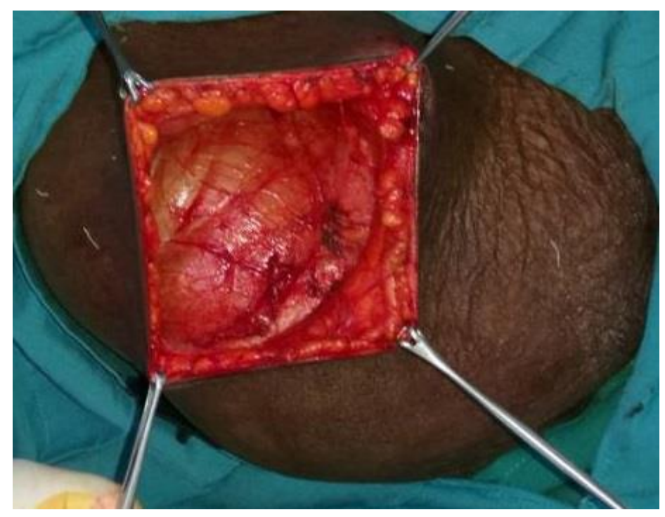
Figure 3: hernia sac laying below the external oblique fascia