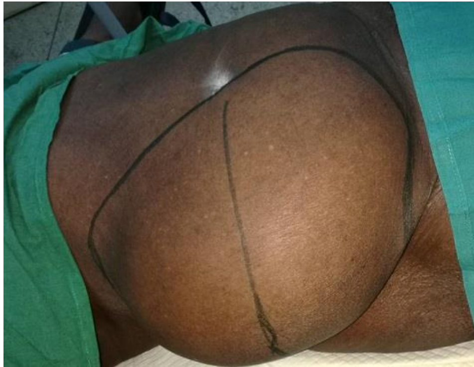
Figure 2: giant intraparietal inguinal hernia (lateral view)