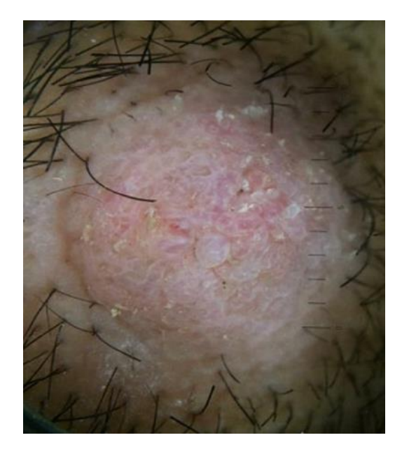
Figure 2 : dermoscopic examination showed sharp demarcation, hairpin vessel and milia-like cyst