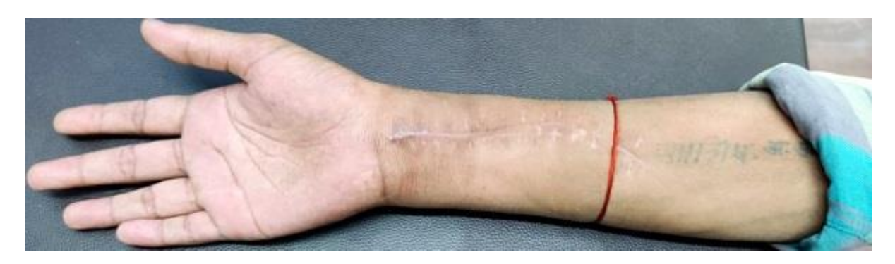
Figure 1: supinated forearm showing scar marks over distal forearm