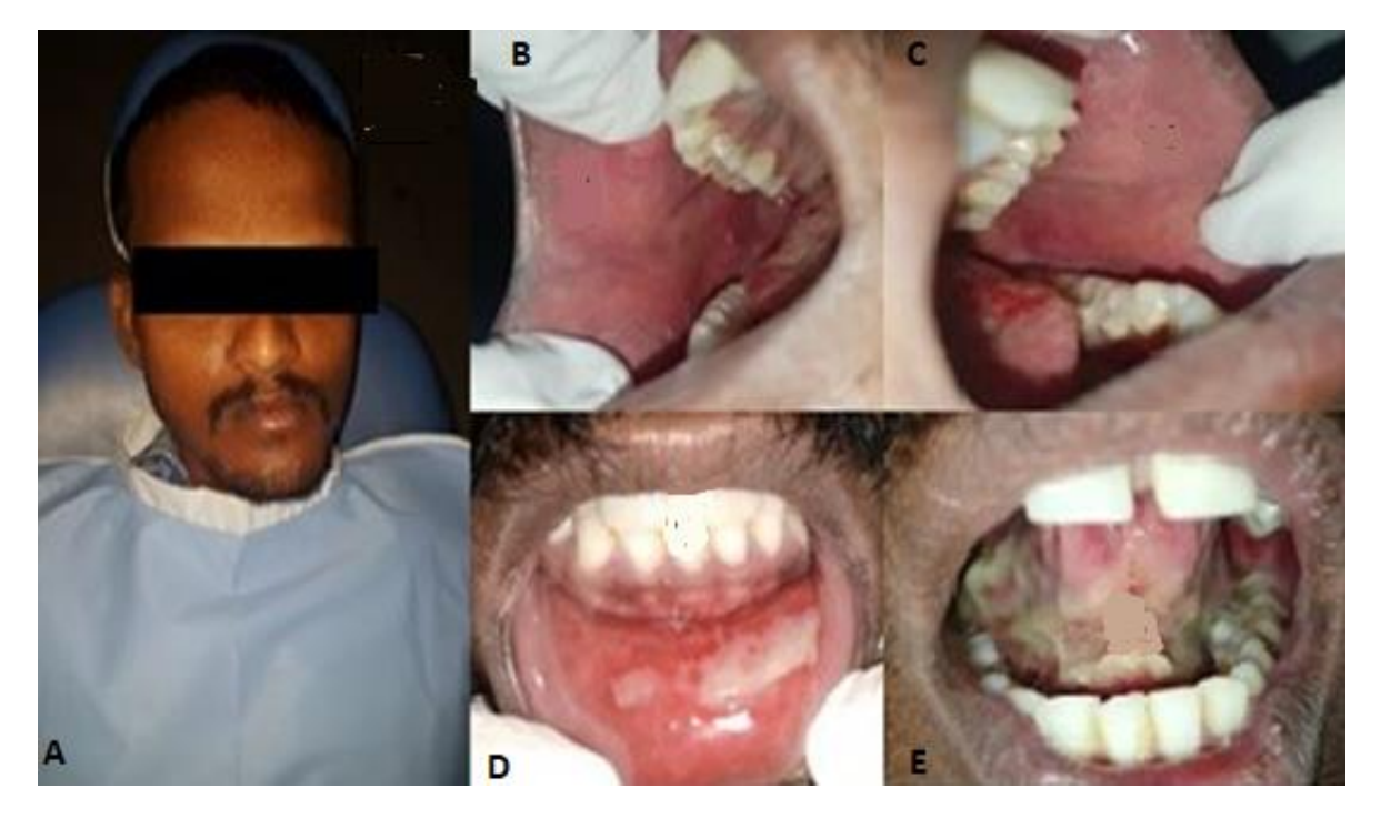
Figure 4 : complete regression of lesions of bilateral buccal mucosa and partial regression on lower labial mucosa and tongue was noticed

Figure 3 : pre-operative pictures showing diffuse erosions and encrustations were noticed on bilateral buccal mucosa, lower labial mucosa and tongue