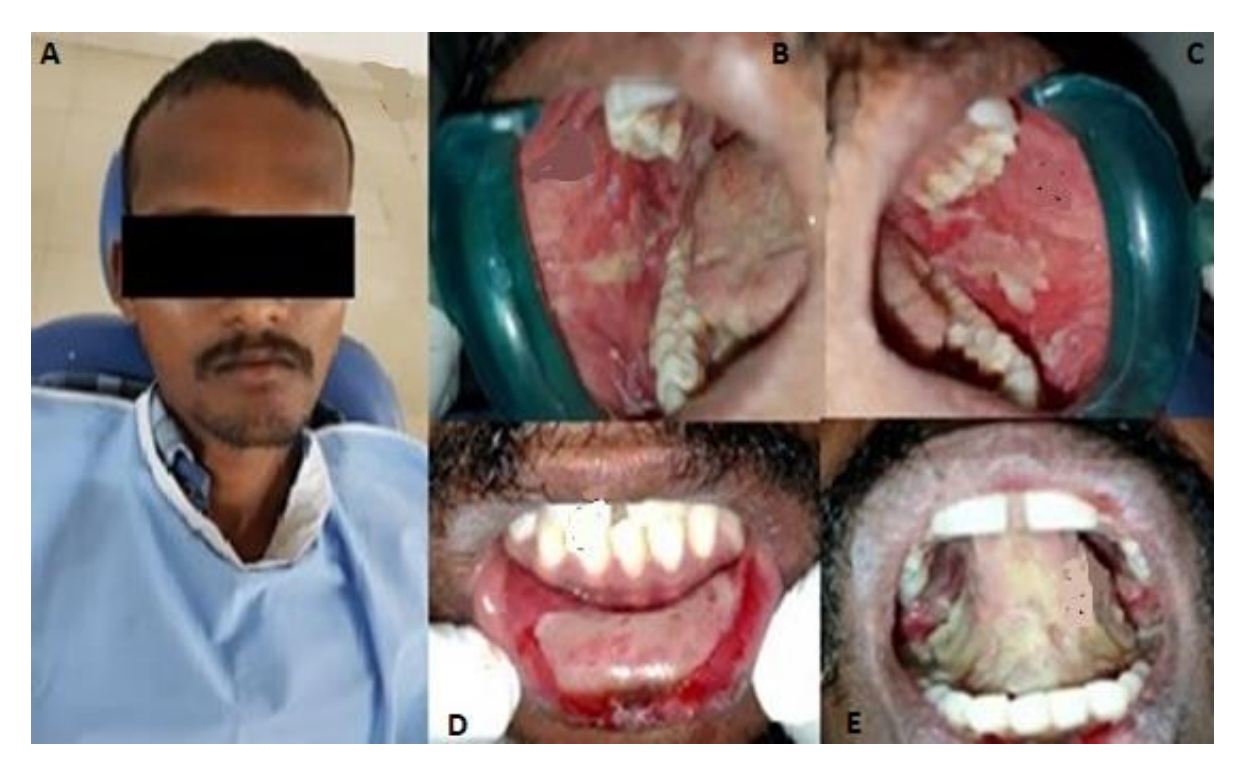
Figure 3 : pre-operative pictures showing diffuse erosions and encrustations were noticed on bilateral buccal mucosa, lower labial mucosa and tongue