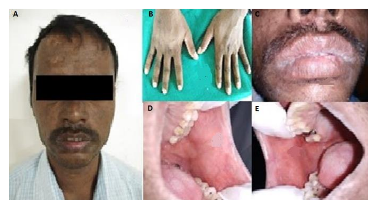
Figure 2: post-operative pictures showing complete regression of the lesions