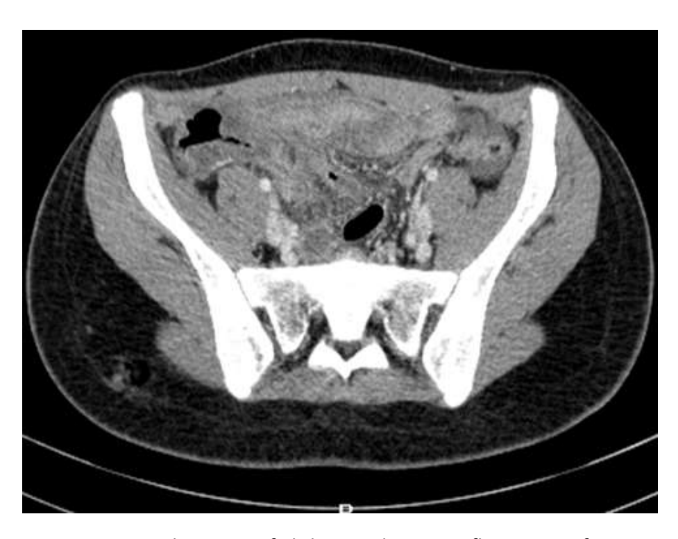
Figure 1: an axial CT scan of abdomen showing inflammatory features surrounding a blind-ending structure arising from the caecum