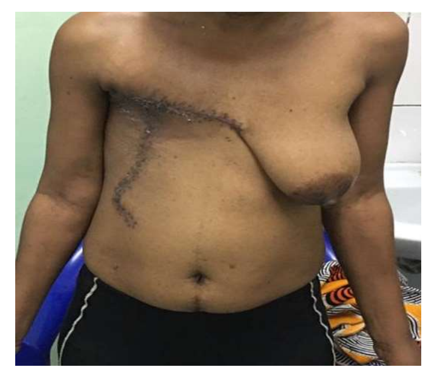
Figure 3: outcome after right mastectomy