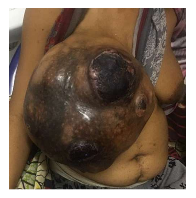
Figure 1: right breast tumor case before surgery