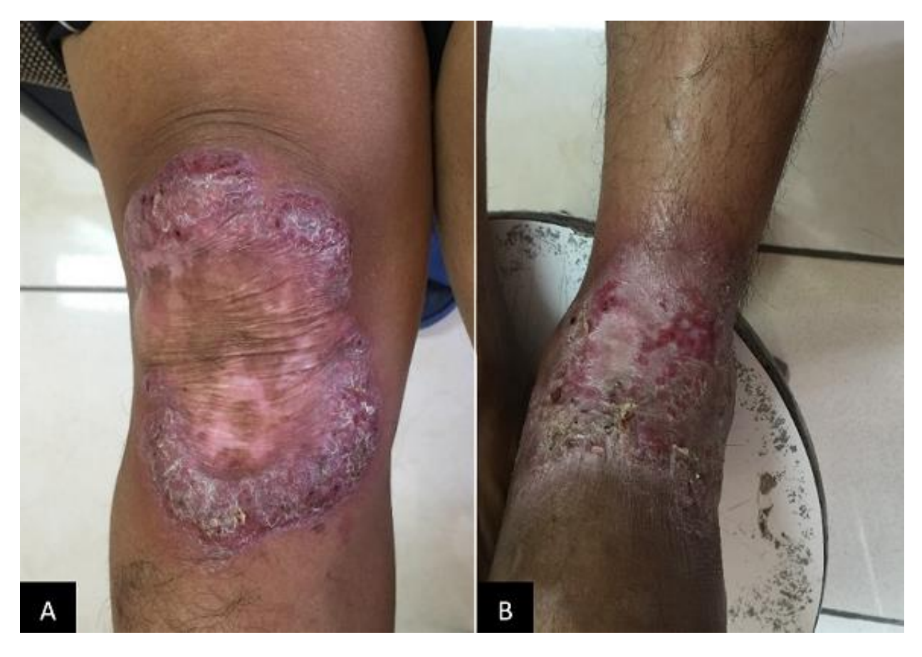
Figure 1 : clinical appearance at the first visit. Left knee region shows reddish plaque with verrucous surface, elevated edge and erythematous case with accompanied by crusting. Left dorsum pedis showed reddish plaque and patch with crusting