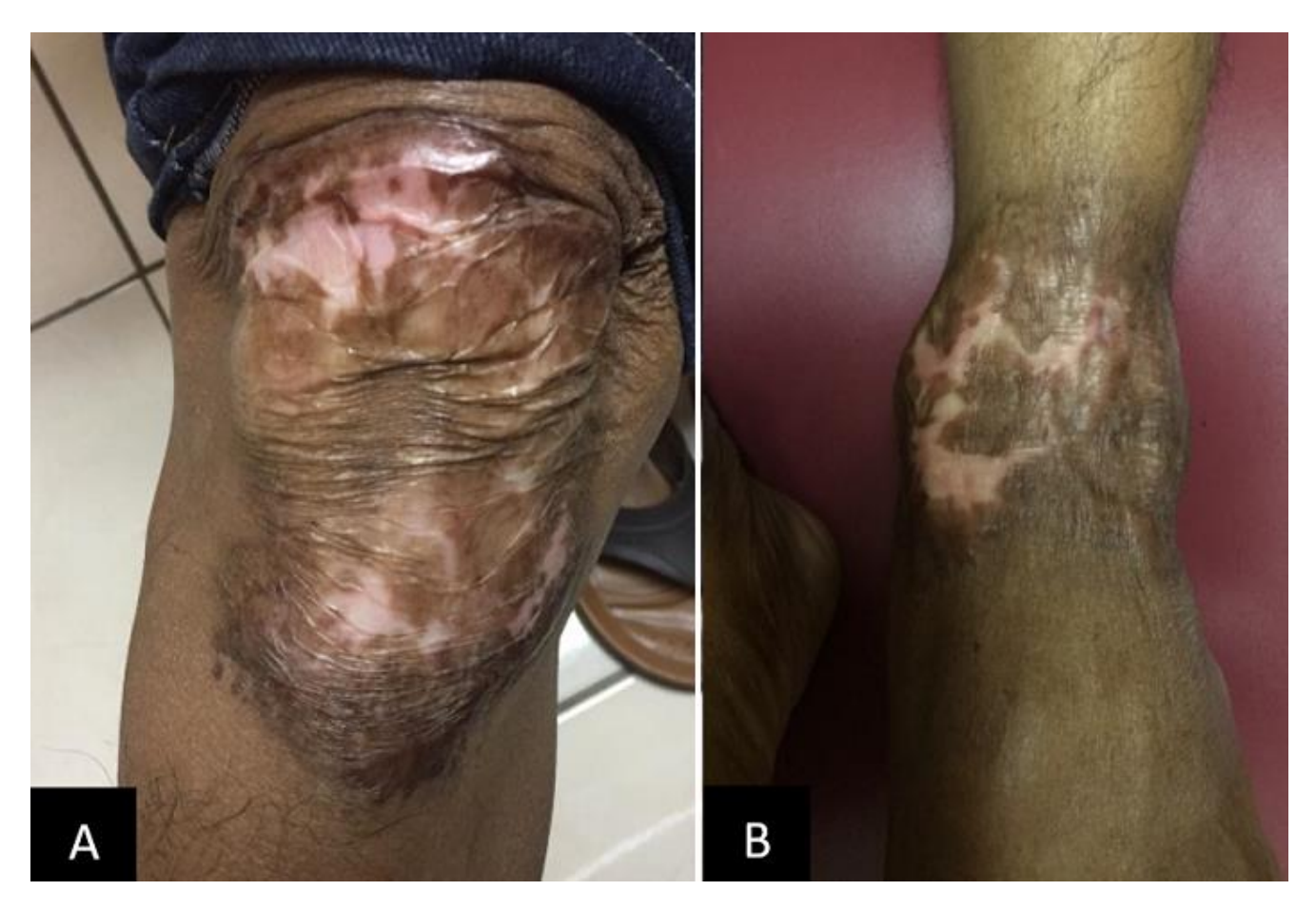
Figure 4: significant lesion improvement was evident after six months