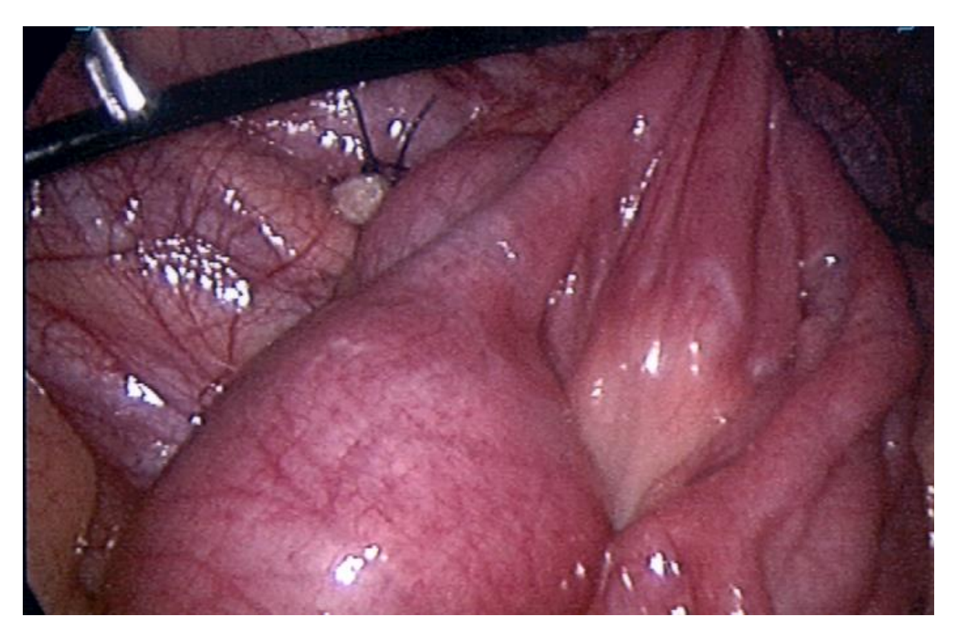
Figure 2 : a laparoscopic disintussusception approach was performed, with no signs of ischemia or perforation after the reduction of the small bowel