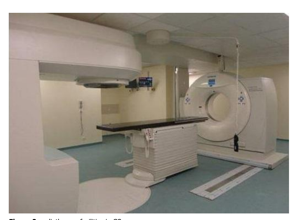
Figure 2: radiotherapy facilities in GS