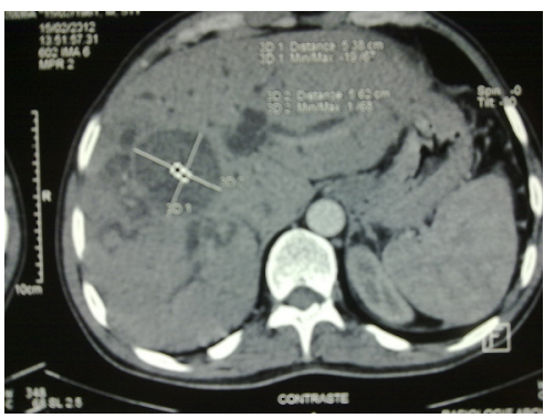
Figure 1 : abdominal CT showing hydatid cyst of 4th & 5th segments of liver communicating wit dilated CBD