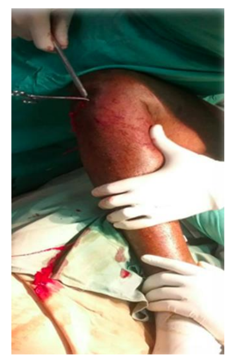
Figure 1 : maintenance of reduction of the fracture hole and reaming with a manual rigid reamer