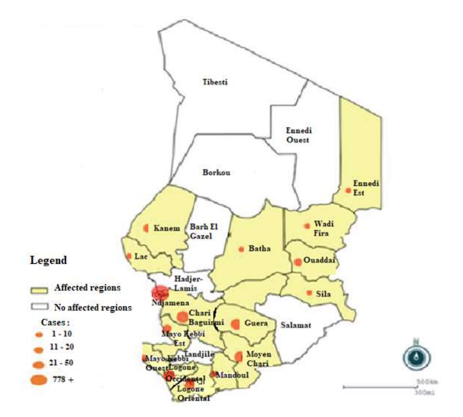
Figure 1: evolution of confirmed cases of COVID-19 in Chad