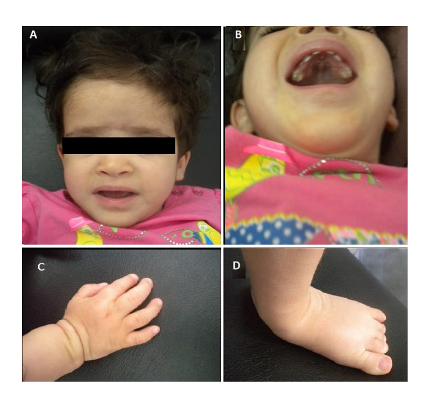
Figure 2 : clinical characteristics of our patient: A) facial phenotype; B) ogival palate; C) brachydactyly and clinodactyly of the fifth finger; D) valgus