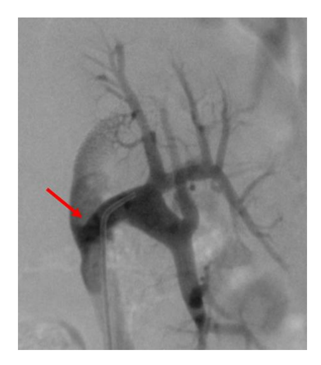
Figure 2: angiogram showing a patent renal transplant anastomosis without stenosis (red arrow)