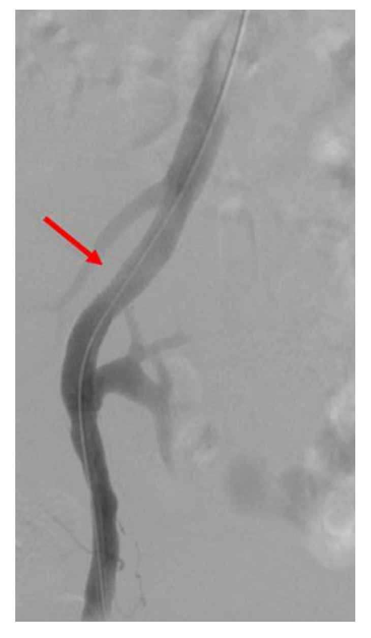
Figure 4 : final angiogram showing a patent iliac artery after stenting without residual stenosis (red arrow)