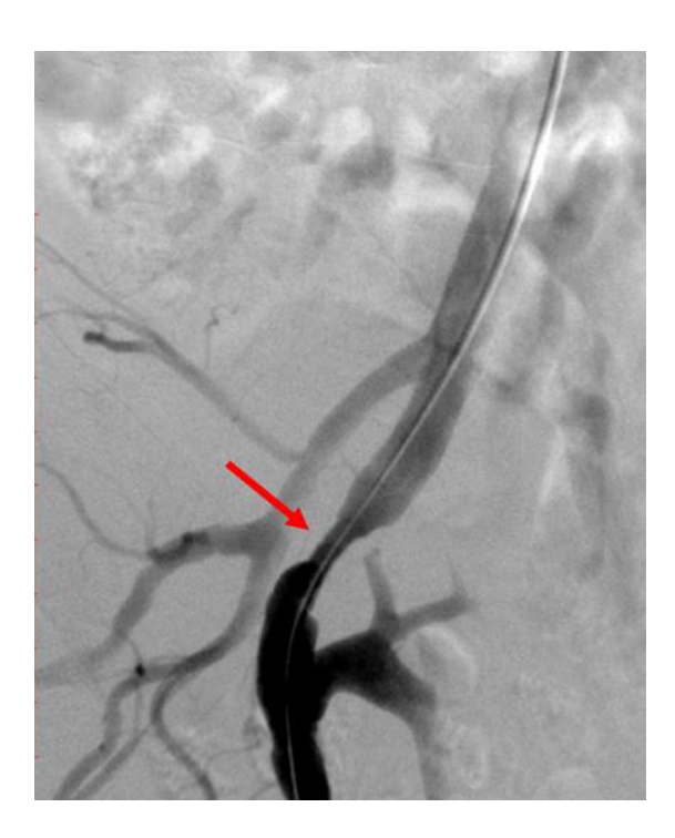
Figure 1 : angiogram showing a tight stenosis of the external iliac artery 1 cm just proximal to the anastomosis of the renal transplant (red arrow)