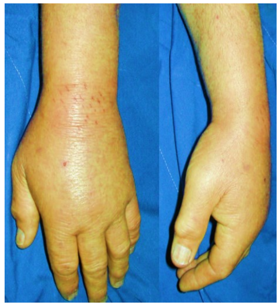
Figure 1: patient presenting with painful left wrist and fever with sequels of scarification