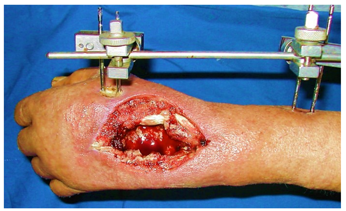
Figure 3: Immobilization with external fixator