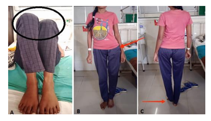
Figure 1 : (A,B,C) pre-rehabilitation figure shows the limb length discrepancy of the left leg