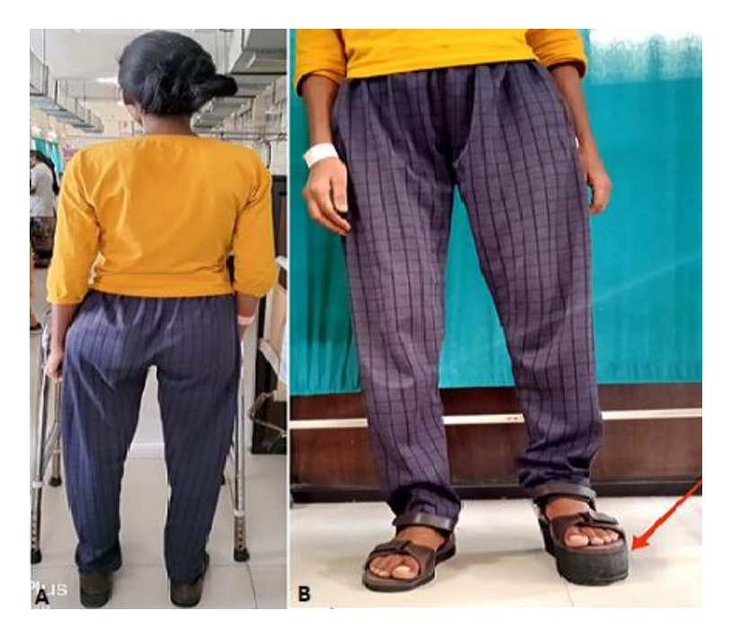
Figure 2 : (A,B) post-rehabilitation figure; arrow represent the patient wears the shoe raised of 2 inches