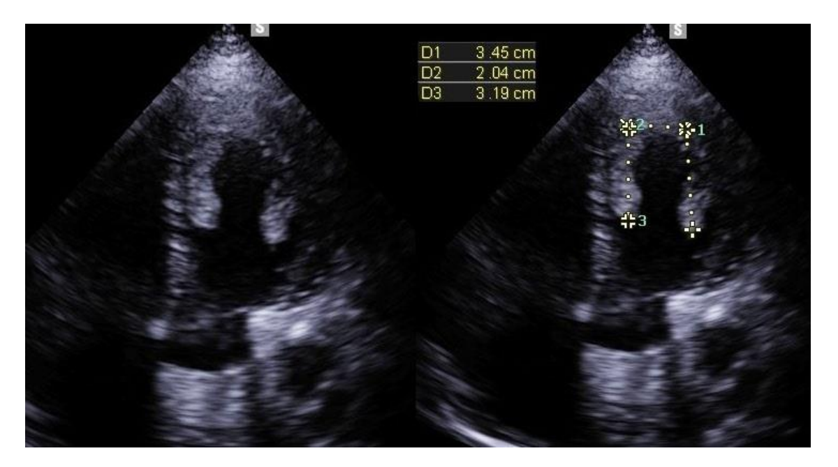
Figure 3: apical view of TTE that shows a large intra LV horseshoe thrombus

Figure 2: para sternal long axis view of TTE that shows bi-ventricular dilatation (tele diastolic diameter of LV 57 mm with that of the RV 38 mm)