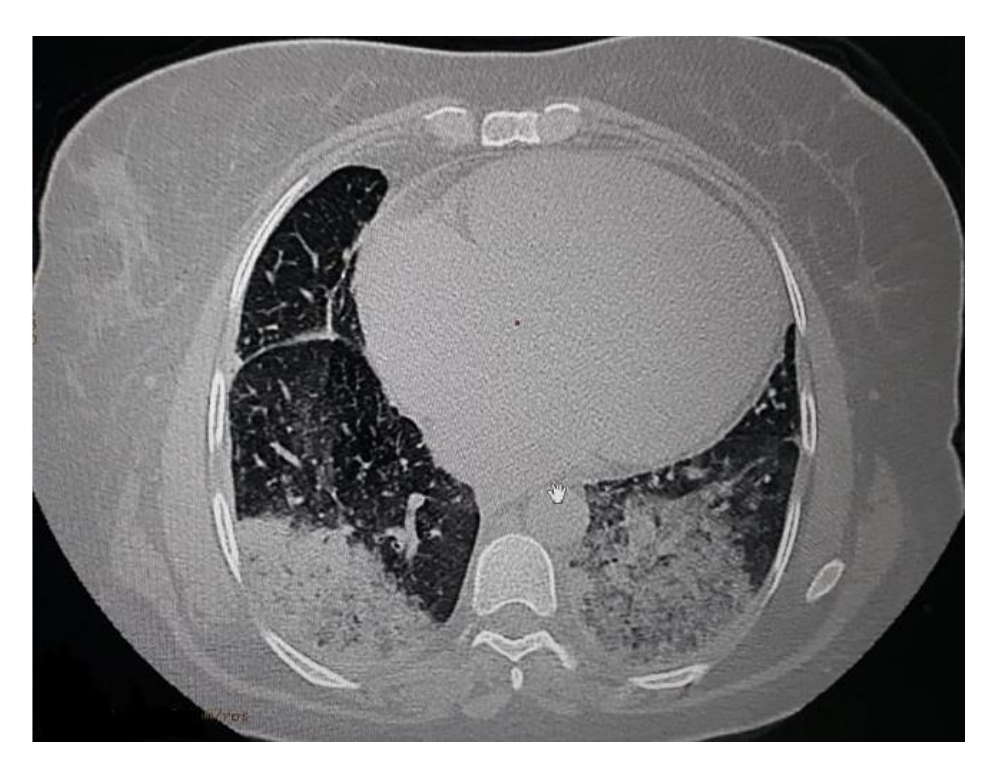
Figure 1: thoracic CT scan showing diffuse patchy ground-glass opacities suggesting COVID-19 pneumonia