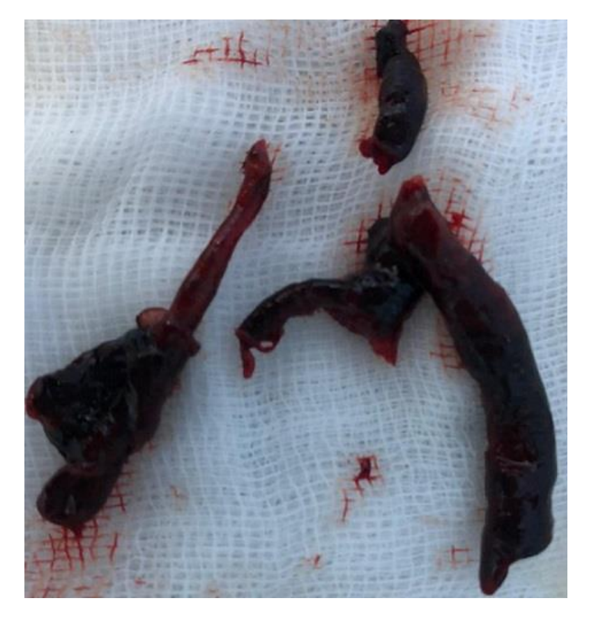
Figure 6: post-operative image showing the thrombi after FOGARTY of left lower limb