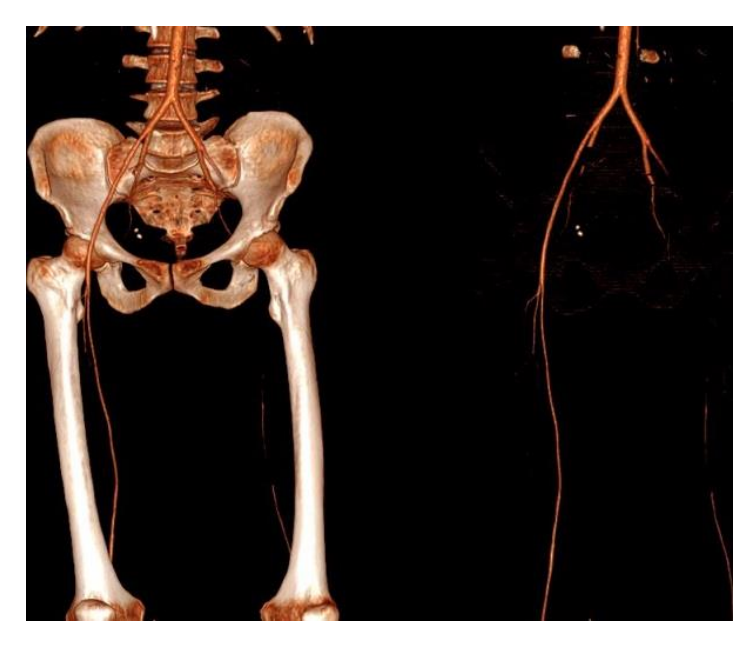
Figure 5: angio-CT scan of lower limb showing an interruption of vascular bed at the level of common femoral artery with partial resumption in the popliteal artery