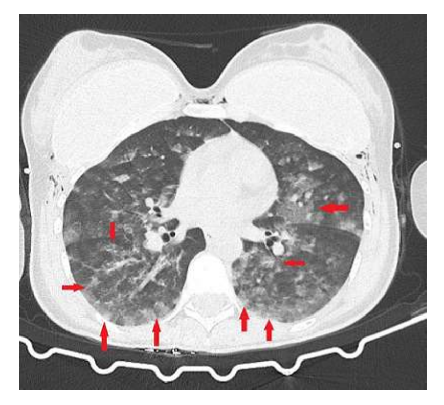
Figure 2 : diffuse ground-glass opacities and consolidations in the basal part of bilateral lungs