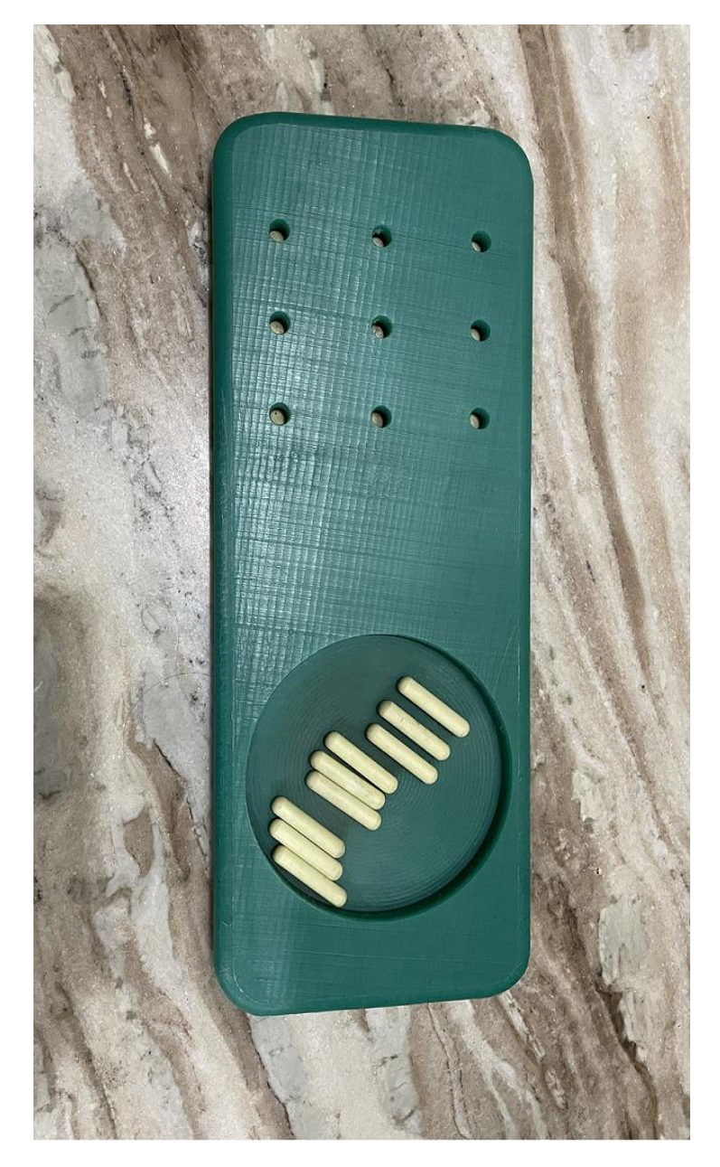
Figure 3 : shows nine pegs with nine-hole peg board that will be used for 9HPT