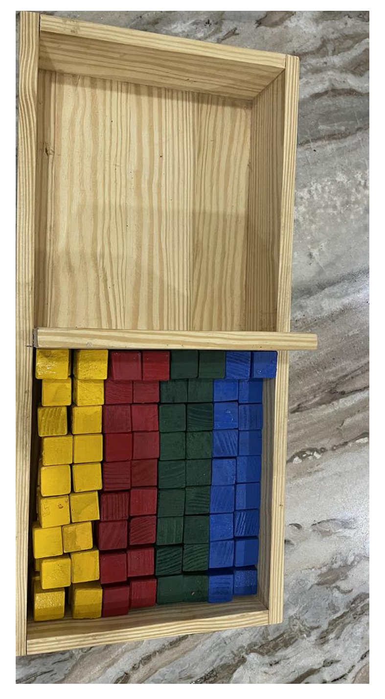
Figure 4 : shows 150 blocks with a partitioned box that will be used for BBT