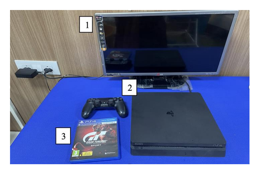
Figure 2 : material that will be used for providing virtual reality and haptic feedback-based intervention for participants in the experimental group, including television screen (1), playstation 4 that provides virtual reality-based gaming with haptic feedback enhanced hand controls (2), DVD of a game named Gran Turismo- the real driving simulator (3)

Figure 1: shows the study procedure in the form of a flow chart