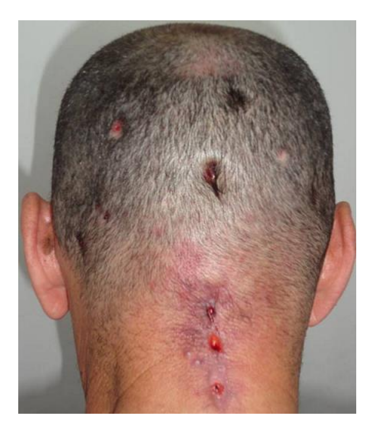
Figure 1 : initial presentation showing multiple scalp fistulas