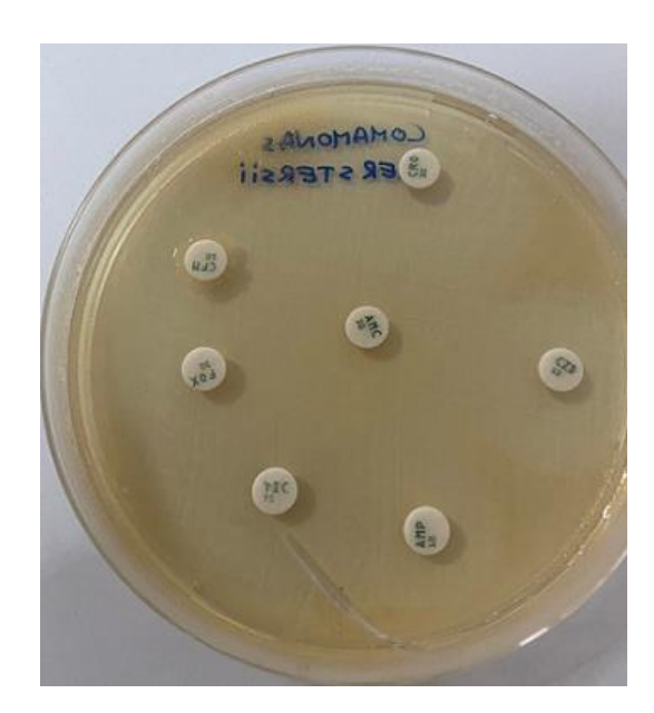
Figure 3: an antibiogram with disc showing a multi sensitive profile