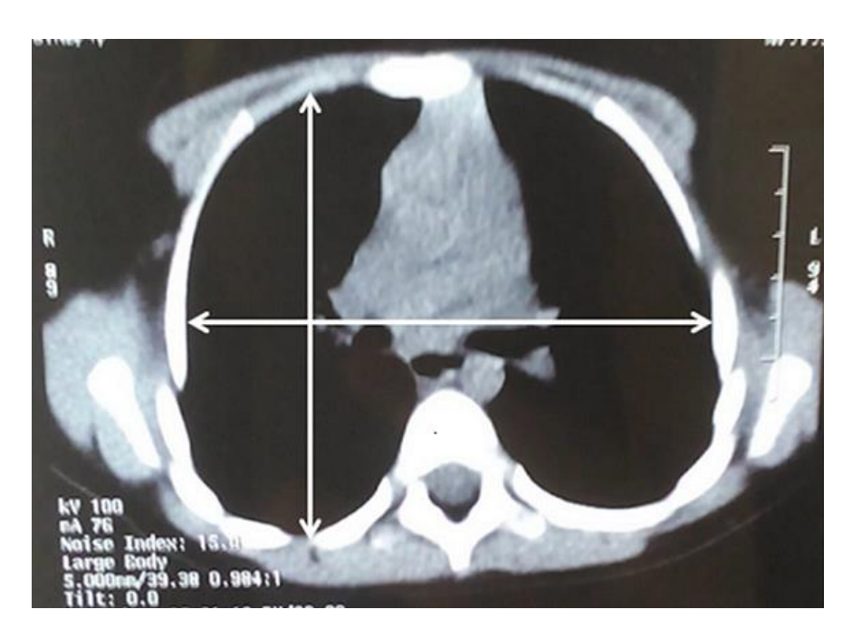
Figure 4 : chest CT showing the overall decrease of transverse diameter of the rib cage