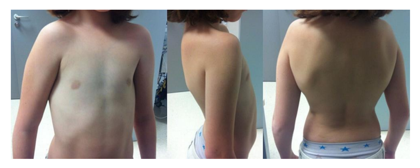
Figure 1 : anterior view of the patient with cleidocranial dysostosis that shows the approximation of the shoulders