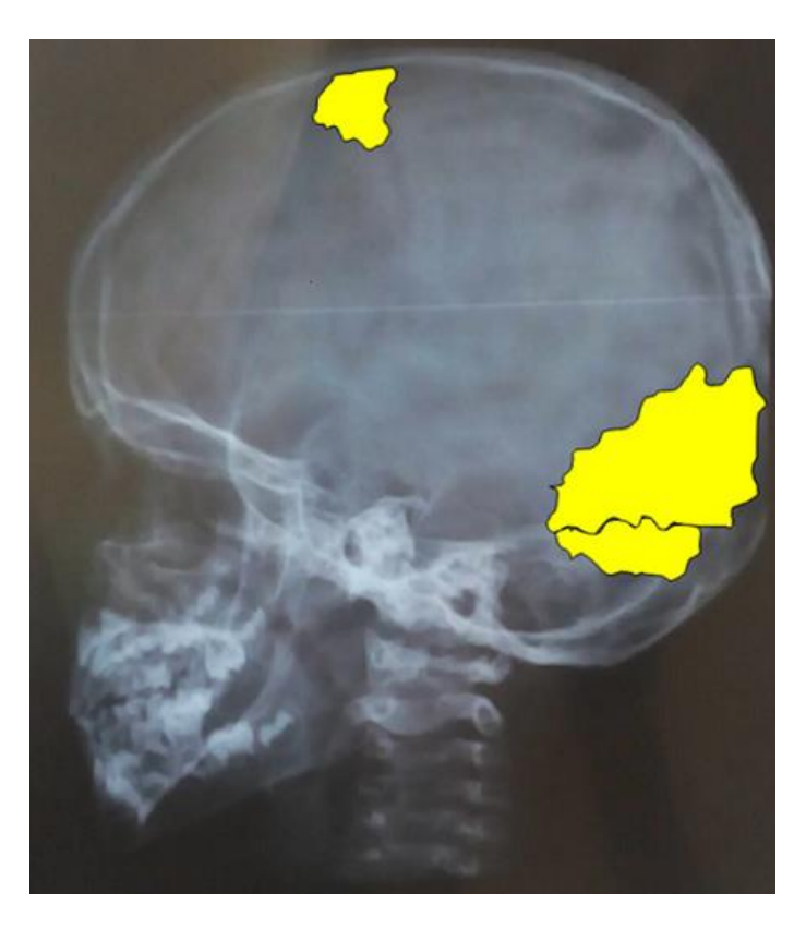
Figure 3 : skull radiograph showing Wormian bones. Note the frontal bossing and the small upper and lower jaw