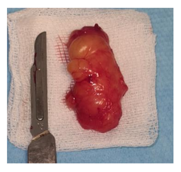
Figure 4: macroscopic image of the surgically excised tissue