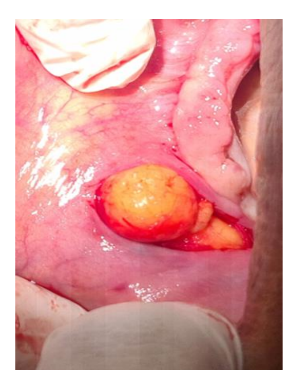
Figure 3 : exposed lobulated, yellowish and poorly encapsulated mass