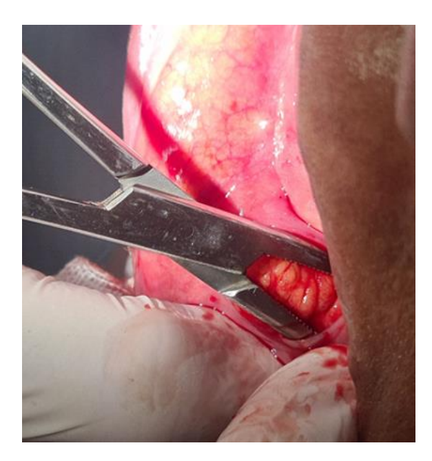
Figure 2 : peripherical dissection with hemostatic forceps