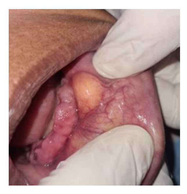
Figure 1 : intraoral examination with tumefaction visible in the buccal mucosa and no signs of trauma