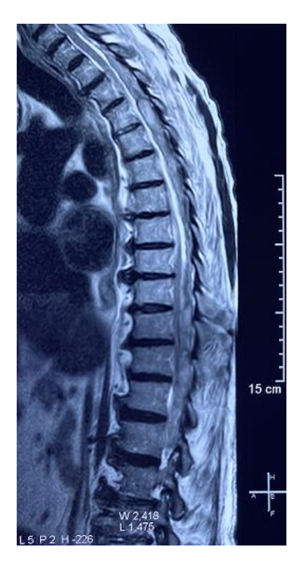
Figure 3: medullary MRI in gradient echo sequence sagittal plane; medullary MRI sagittal plane showing the epidural lesion in hypersignal gradient echo with a peripheral halo on hyposignal