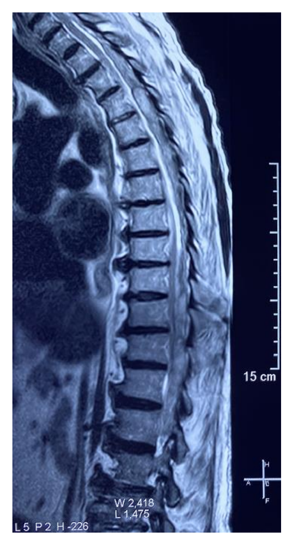
Figure 2: medullary MRI in T2 weighted sequence sagittal plane; medullary MRI sagittal plane showing the same well circumscribed epidural lesion in heterogenous hypersignal T2 extending from D1 to L1