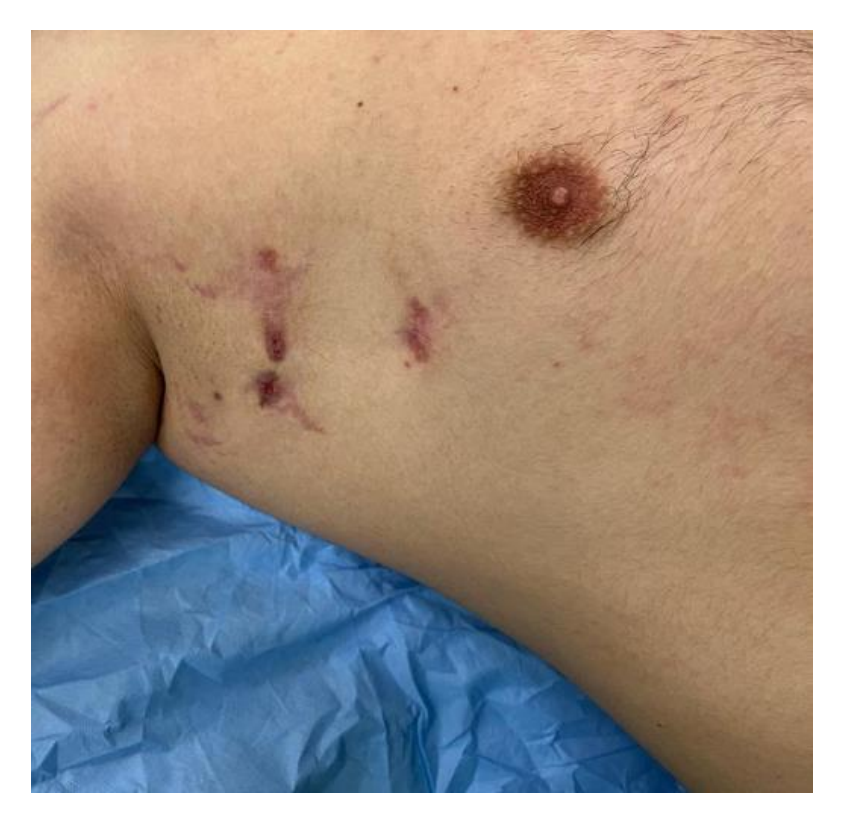
Figure 1 : fistulas of the axillary area associated with lymphadenopathy