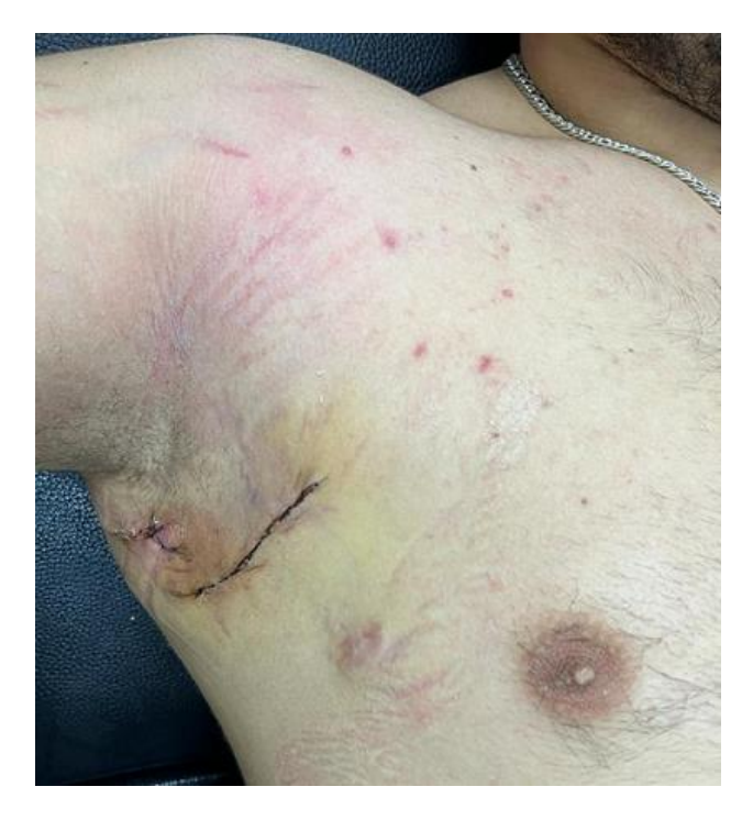
Figure 5: surgery outcome; intradermal suture postoperative