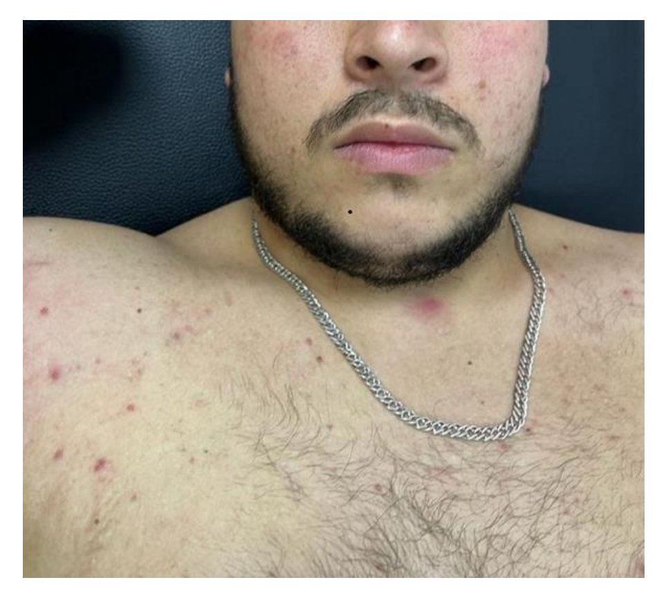
Figure 2: folliculitis located in the face and the chest area