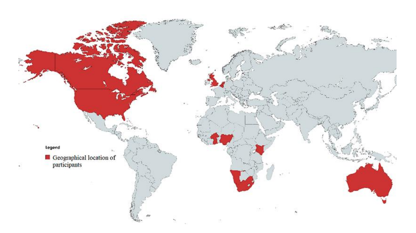
Figure 1: geographical distribution of participants