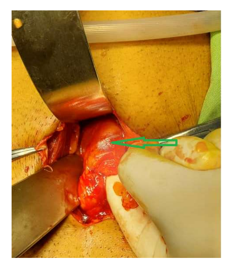
Figure 4: intraoperative photos showing the double J stent in the peritoneal cavity (arrow)

Figure 3 : abdominal CT scan showing: A) distal coil of double J stent in the peritoneal cavity (arrow); B) double J stent in the peritoneal cavity (arrow); C) proximal coil of double J stent in the peritoneal cavity (arrow); D) helical computed tomography shows the DJ stent's total displacement in the peritoneal cavity (arrow)