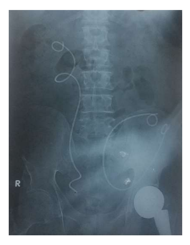
Figure 2 : plain radiography X-ray showing both DJ stents after failed removal