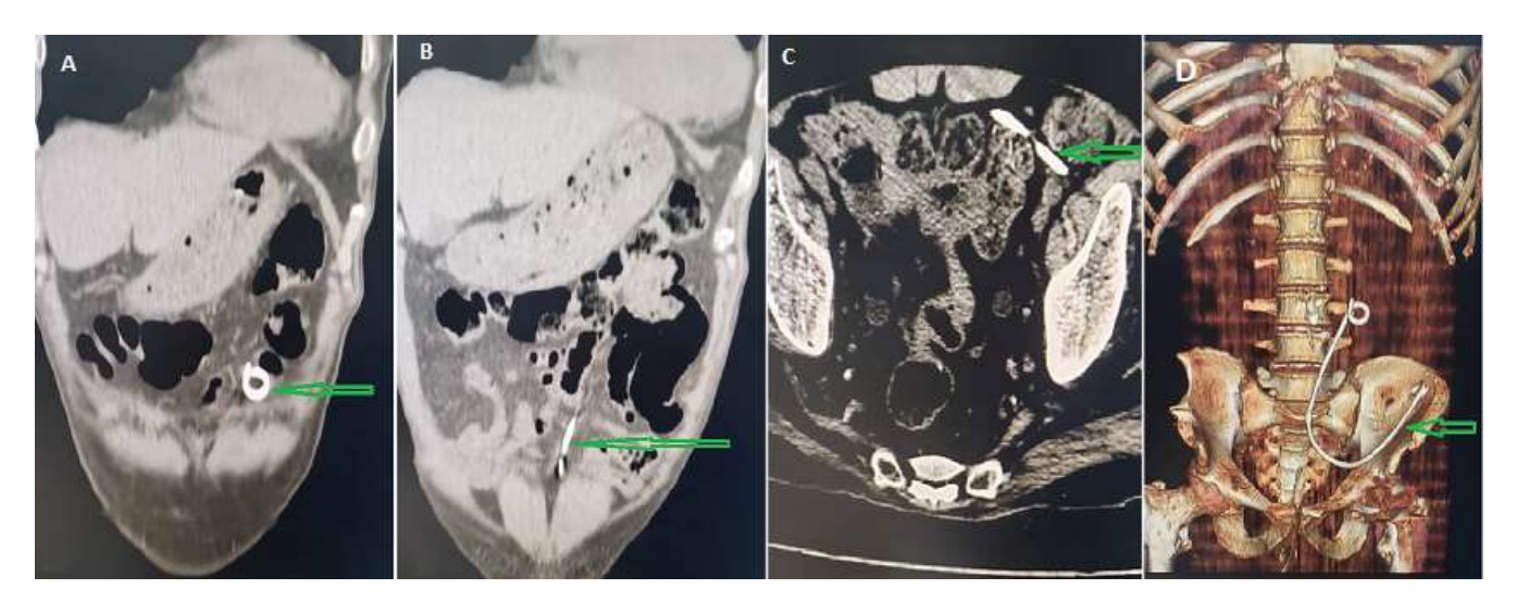
Figure 3 : abdominal CT scan showing: A) distal coil of double J stent in the peritoneal cavity (arrow); B) double J stent in the peritoneal cavity (arrow); C) proximal coil of double J stent in the peritoneal cavity (arrow); D) helical computed tomography shows the DJ stent's total displacement in the peritoneal cavity (arrow)