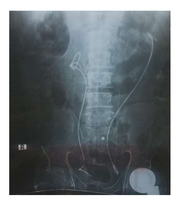
Figure 1 : plain radiography X-ray showing both DJ stents at first insertion